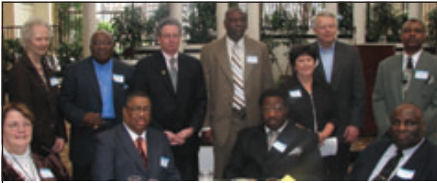
Ministers and elected officials before the start of last week's luncheon