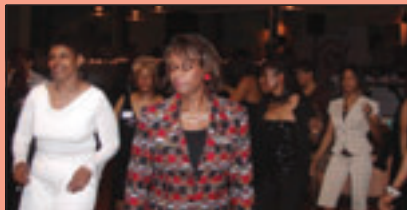
Scott alumni enjoying the dance