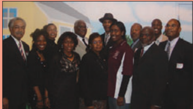
Scott High School Alumni Association Board Members and Officers