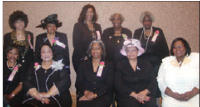
Foundation and Honorees