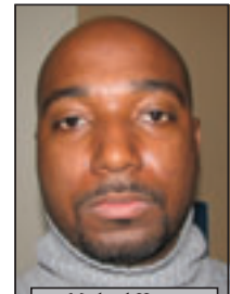
Michael Hayes Minister of Culture