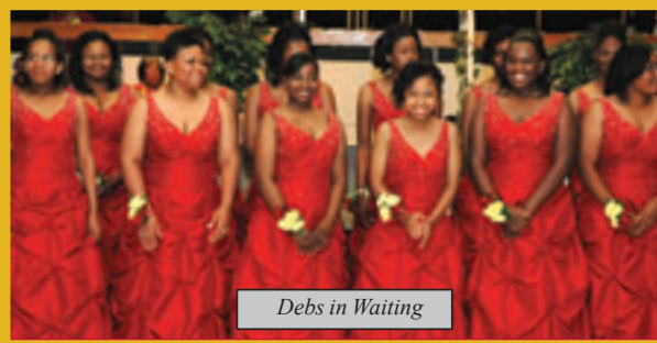
Debs in Waiting