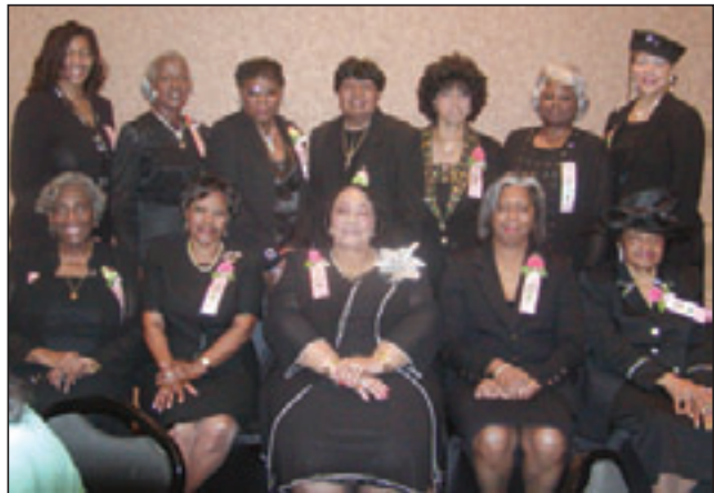
Zeta Alpha Omega Foundation