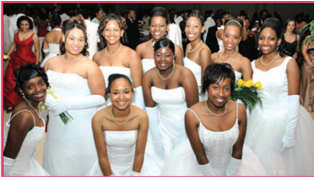
UT scholarship winners