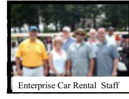
Enterprise Car Rental Staff