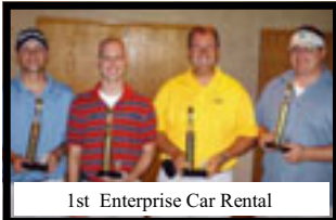
1st Enterprise Car Rental