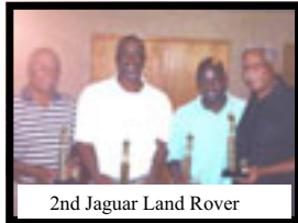
2nd Jaguar Land Rover