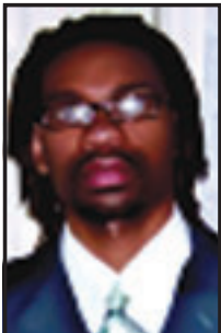
By Bishop Stephen Ward Guest Editorial

It is time for us to address the social and civic injustice and discord that permeates from the 22 nd floor of Government Center and embraces unethical values that zero into and destroys the zenith of one's character, while plaguing communities and families...yes, innocent citizens of Toledo.