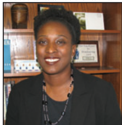
Award for Best Documentary the following year.

coming, Sometimes I am haunted by memories of red dirt and clay , received its national premiere on PBS. Widely recognized as being the first film to explore the rural roots of African-American life, it earned her the NBPC Prized Pieces Award for Best Documentary in 1999 and the Paul Robeson