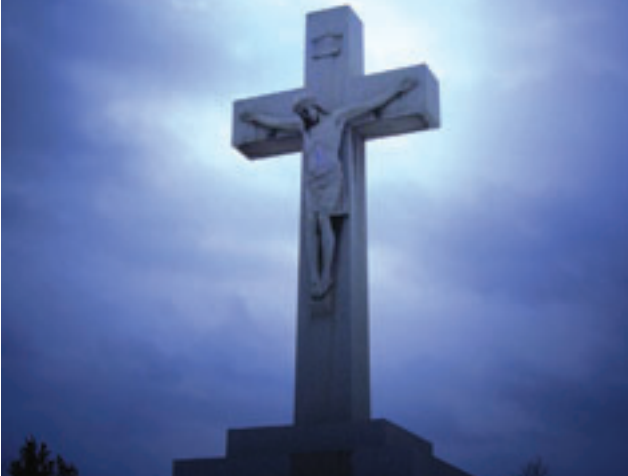
A dozen different Toledo-area pastors and their congregations will gather at Mt. Nebo Missionary Baptist Church on Good Friday to celebrate the beginning of the Easter weekend. Service will start at noon and end at 3 p.m.