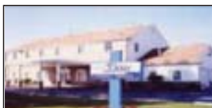
2550 Nebraska Avenue Toledo, Ohio 43607

2550 NEBRASKA AVE. TOLEDO, OHIO 43607 Phone: 419-534-2550 www.houseofday.com Email: mday@houseofday.com