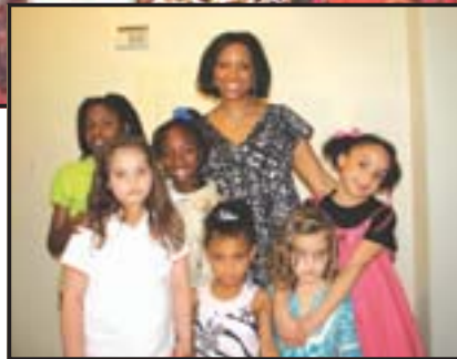
Victoria Trail with the little princesses