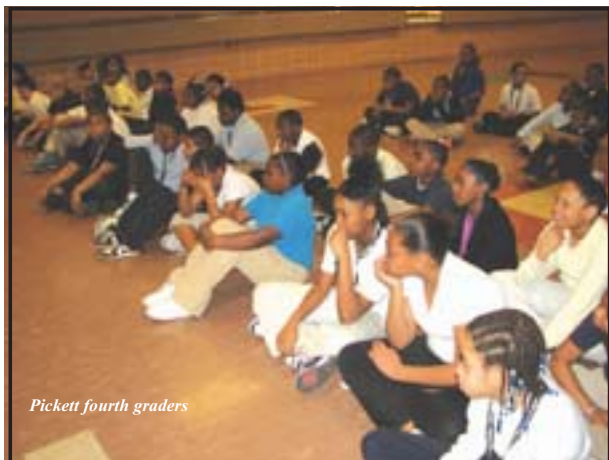
Pickett fourth graders