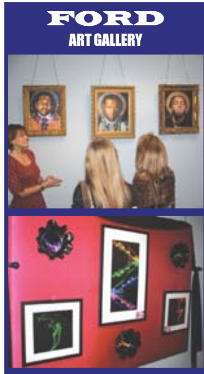
FORD ART GALLERY