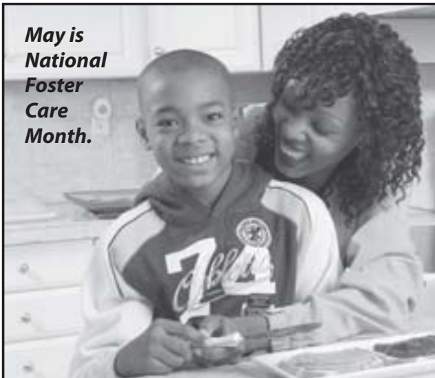
May is National Foster Care Month.