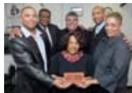
A Few Brick Donors

currently located at 1339 Dorr Street, has just launched their "Brick Campaign". The TUFUC has begun this campaign in an effort to raise funds for the new building which will be built at the corner of Detroit Avenue at Dorr Street. If