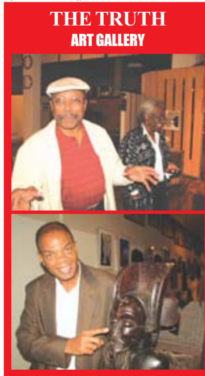
THE TRUTH ART GALLERY