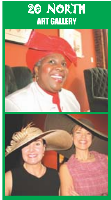
20 NORTH ART GALLERY

The month of May has brought an additional splash of art into downtown Toledo.