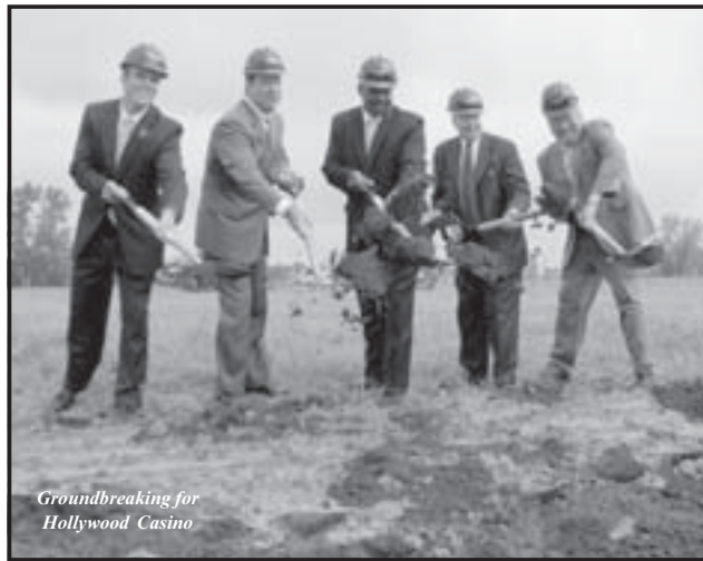
Groundbreaking for Hollywood Casino