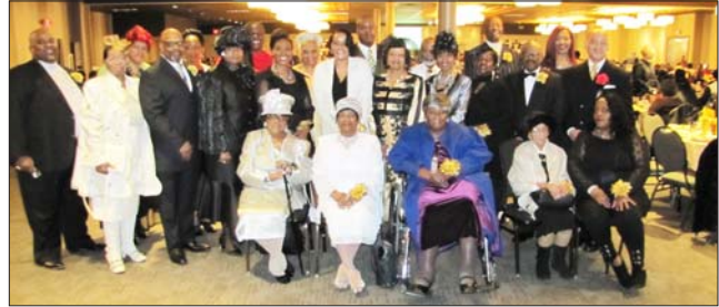
The 2020 Honorees - the Silent Soldiers