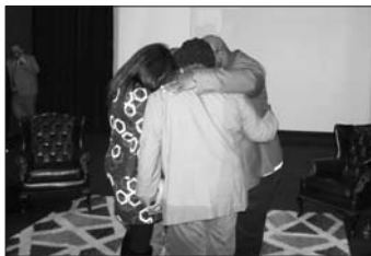
Presenters huddle before conversation begins